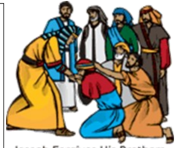
Joseph Forgives His Brothers

This Lent, we will journey with Joseph, son of Jacob, to the cross. While Joseph was not crucified for our salvation, the themes of betrayal, temptation, trials, suffering, forgiveness, reconciliation, God's will, mercy, and endurance have much in common with Jesus' journey to the cross. We will find much in common with Joseph—the same struggles and the same strength in God's good and gracious will. In worship, we will hear portions of Genesis, chapters 30-50 and Luke, chapters 22-23. If you would like the whole picture, please read these chapters before or during Lent.