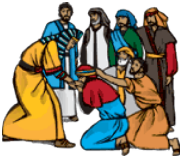
Joseph Forgives His Brothers

This Lent, we will journey with Joseph, son of Jacob, to the cross. While Joseph was not crucified for our salvation, the themes of betrayal, temptation, trials, suffering, forgiveness, reconciliation, God's will, mercy, and endurance have much in common with Jesus' journey to the cross. We will find much in common with Joseph—the same struggles and the same strength in God's good and gracious will. In worship, we will hear portions of Genesis, chapters 30-50 and Luke, chapters 22-23. If you would like the whole picture, please read these chapters before or during Lent.