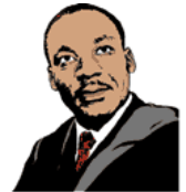
Martin Luther King, Jr. Day

Monday, January 19th we will have the day off to commemorate MLK Jr. Day. Presidents of both parties have called on Americans to honor Dr. King's legacy by making it a day of service to the community. I encourage everyone to find some way to make their community brighter during that weekend. Bethlehem students, if you do any community service don't forget to log your hours using the forms hanging on the bulletin board outside the office.